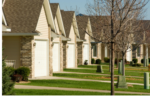
Private property is the foundation upon which all of our other rights are based.

In a system of private property, economic goods are owned by private individuals. Property rights give the owner the ability to use or transfer the item in any way he sees fit, without obtaining anyone else's permission, so long as he doesn't thereby violate someone else's property rights. On the one hand the concept seems obvious, but on the other it was a fairly recent historical development largely confined to the Western European countries. Generally speaking, private individuals in other regions had