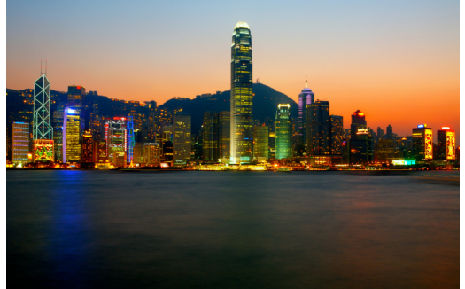
Hong Kong's place as the most economically free country in the world means that it is also one of the wealthiest.

Although it's a pleasant theory that economic freedom goes hand in hand with prosperity, the obvious question arises: Is it actually true? The answer is a resounding "yes"! The Heritage Foundation and The Wall Street Journal , based on significant academic research by economists, put out an annual ranking of countries according to an "Index of Economic Freedom." This index gives countries an overall percentage of economic freedom, based on 10 factors such as trade barriers, tax rates, monetary stability, ability to hire and fire workers, etc.