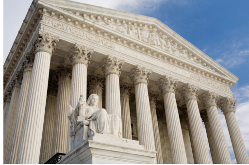
Courts must fairly enforce the law and contracts for the marketplace to operate efficiently.

In a free market, anyone is free to start a business and risk his own (or borrowed) capital, and let the consumers be the ultimate arbiters. This provides the best mechanism to harness the bits of knowledge and expertise that are dispersed throughout the economy. In contrast, under full-blown socialism an innovator would have to send his idea up the chain of command, and wait for approval before carrying it out. Beyond the bureaucracy, this system suffers from the fact that no group of planners—no matter how smart—can possibly amass all the information possessed by the whole of society. Consequently, the decisions of a socialist central board will always be more arbitrary and ignorant, even if the board